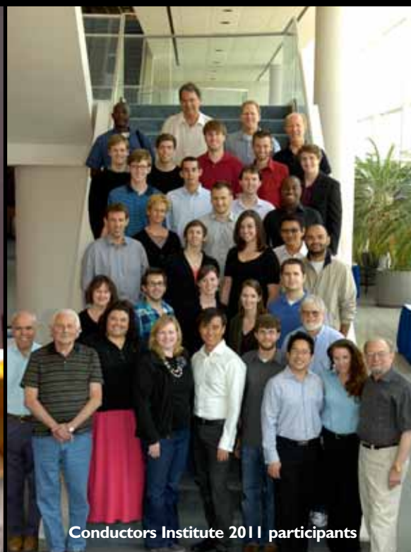
Conductors Institute 2011 participants